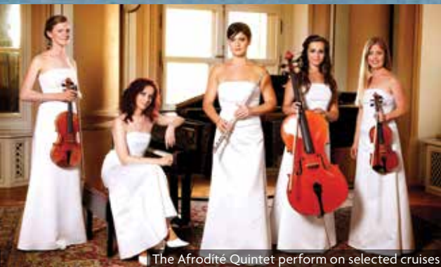
The Afrodité Quintet perform on selected cruises