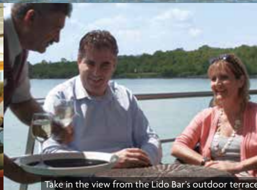
Take in the view from the Lido Bar's outdoor terrace