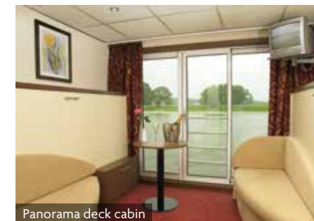
Panorama deck cabin

Main deck cabins: These cabins are on the lower deck and are the same size and layout as the panorama deck cabins, with the same facilities. The only difference is the outside view, which is via two small windows.