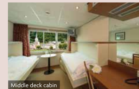
Middle deck cabin