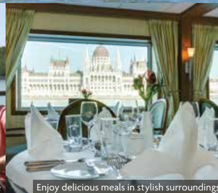
Enjoy delicious meals in stylish surroundings