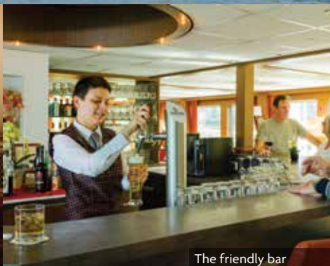
The friendly bar